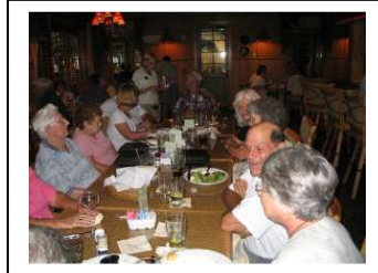
Dinner at Cane Gardens