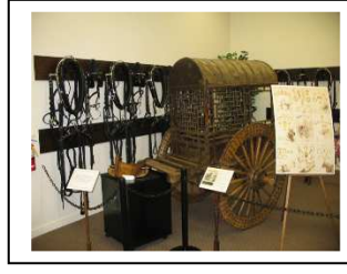
An Oriental Cart