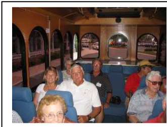
Trolley Ride at the Villages