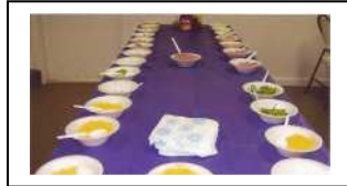
Omelet in a Bag fixings