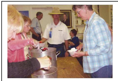
Strawberry night at the rally