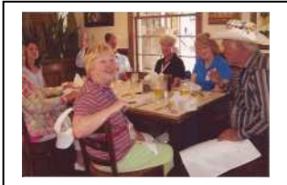
Favorite eaterie in St. Augustine The Columbia Restaurant