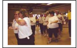
The White Team parades before the Olympic Games. They took first place.