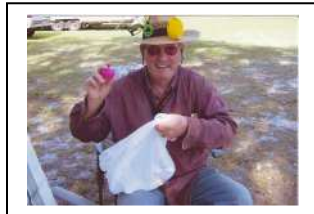
A happy Easter egg hunter.