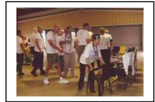
The Green Team placed third in spite of their protests.