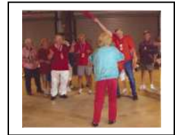
The Red Team's cheer helped them earn second place.