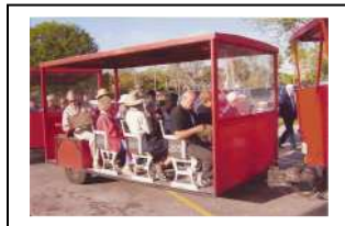
The Little Red Train, our tour and sight-seeing transportation while visiting the old city.