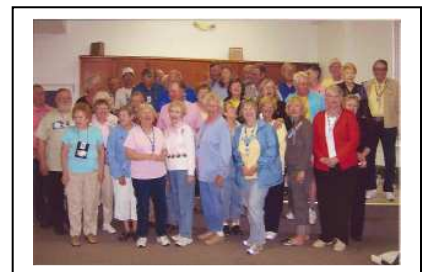
The Pink, Yellow and Blue Teams, all winners who did not place.