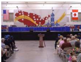
Main Assembly Hall