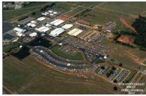
The Fair Grounds