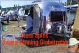
Herb's 1965 Award-Winning Globetrotter