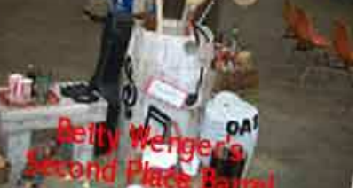
Billy Wenger's Second Place Barrel