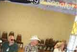
Where's the Pizza?