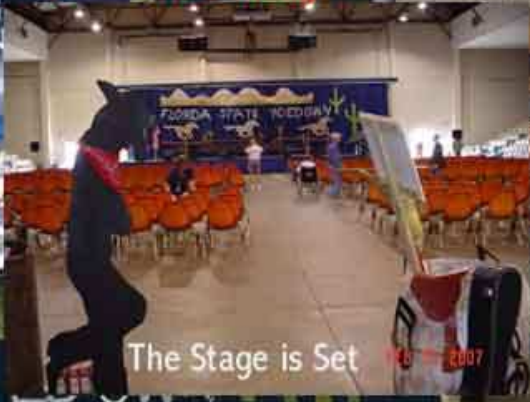
The Stage is Set